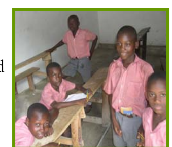
Boys attending school.

parents barely have money to buy rice, and certainly none to pay for an education, even at this meager cost. Their choice was made for them. One must survive. Unless help arrives, the literacy of Haiti will continue to plummet and these children will have no hope for a better life. For as little as $10, donors can help feed one poor child of Haiti for one year with academic knowledge, knowledge of the love of Jesus, and wholesome food once a day.